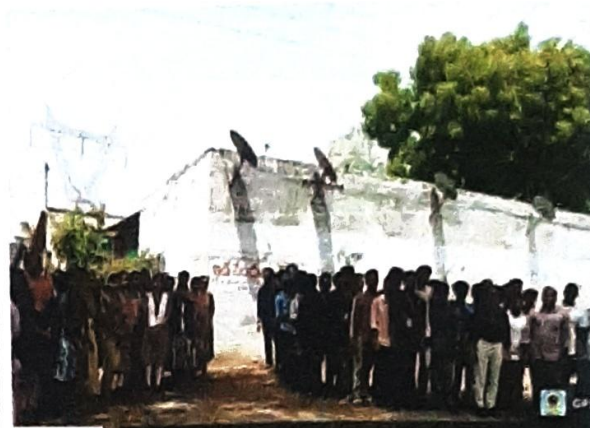
Khammam, Telangana, India SR & BGNR GOVERNMENT ARTS AND SCIENCE COLLEGE KHAMMAM Khammam, Telangana 507002, India Lat 17.251132° Long 80.169886° 30/05/22 01:33 PM