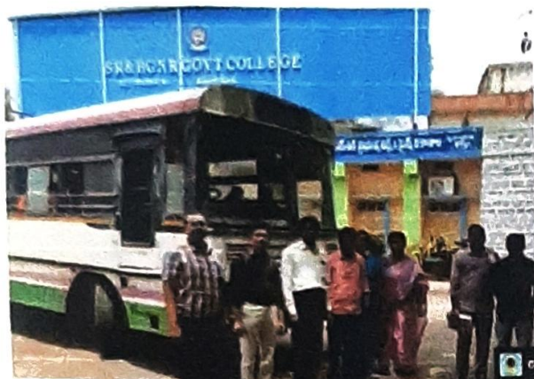
Khammam, Telangana, India SR & BGNR GOVERNMENT ARTS AND SCIENCE COLLEGE KHAMMAM Khammam, Telangana 507002, India Lat 17.251132° Long 80.169886° 30/05/22 01:05 PM