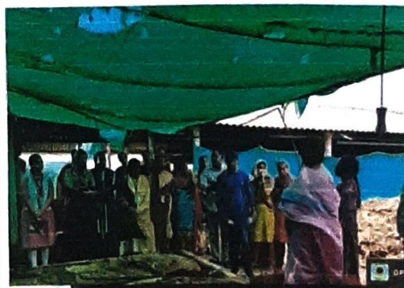
Khammam, Telangana, India SR & BGNR GOVERNMENT ARTS AND SCIENCE COLLEGE KHAMMAM Khammam, Telangana 507002, India Lat 17.251132° Long 80.169886° 30/05/22 01:40 PM