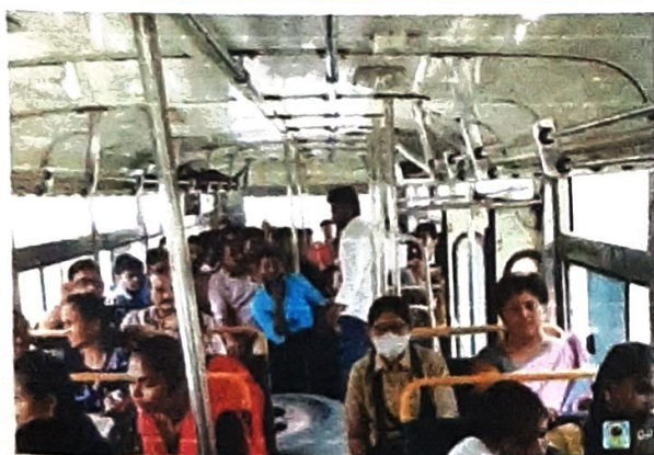
Khammam, Telangana, India SR & BGNR GOVERNMENT ARTS AND SCIENCE COLLEGE KHAMMAM Khammam, Telangana 507002, India Lat 17.251132° Long 80.169886° 30/05/22 01:16 PM